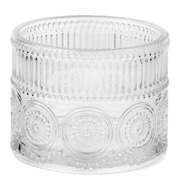
Wavy glass candle jars