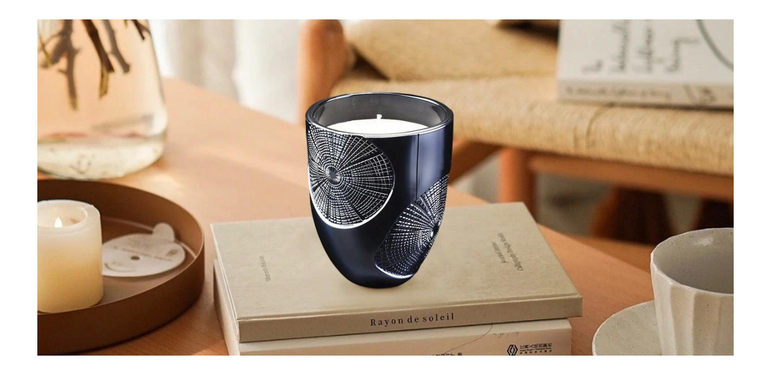
This 373ml bright blue ring glass candle jar not only brings you warmth and light, but also adds a touch of dreamy color to your space with its unique bright blue tone.

Your logo can be designed with exclusive label on the candle jars for your brand