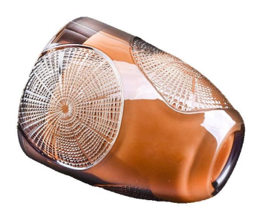
ring pattern purple glass candle jar