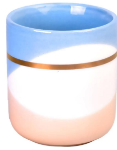
Gold ring blue orange wavy pattern