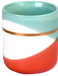
Gold ring cyan red wavy pattern