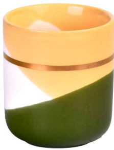
Gold ring yellow green wavy pattern