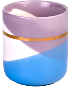
Gold ring purple blue wavy pattern