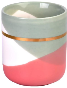
Gold ring green red wavy pattern