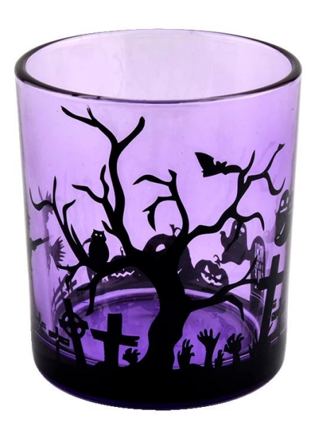
ligth purple \underline{\textbf{glass candle jars}}