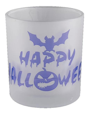
Blue Halloween graffiti \underline{\textbf{glass candle jar}}