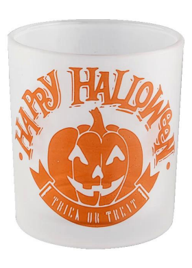
Yellow Halloween graffiti glass candle jar