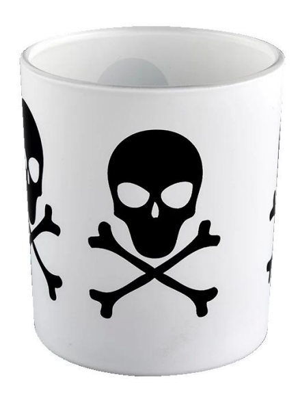
Halloween black skull man graffiti \underline{\textbf{glass candle jar}}