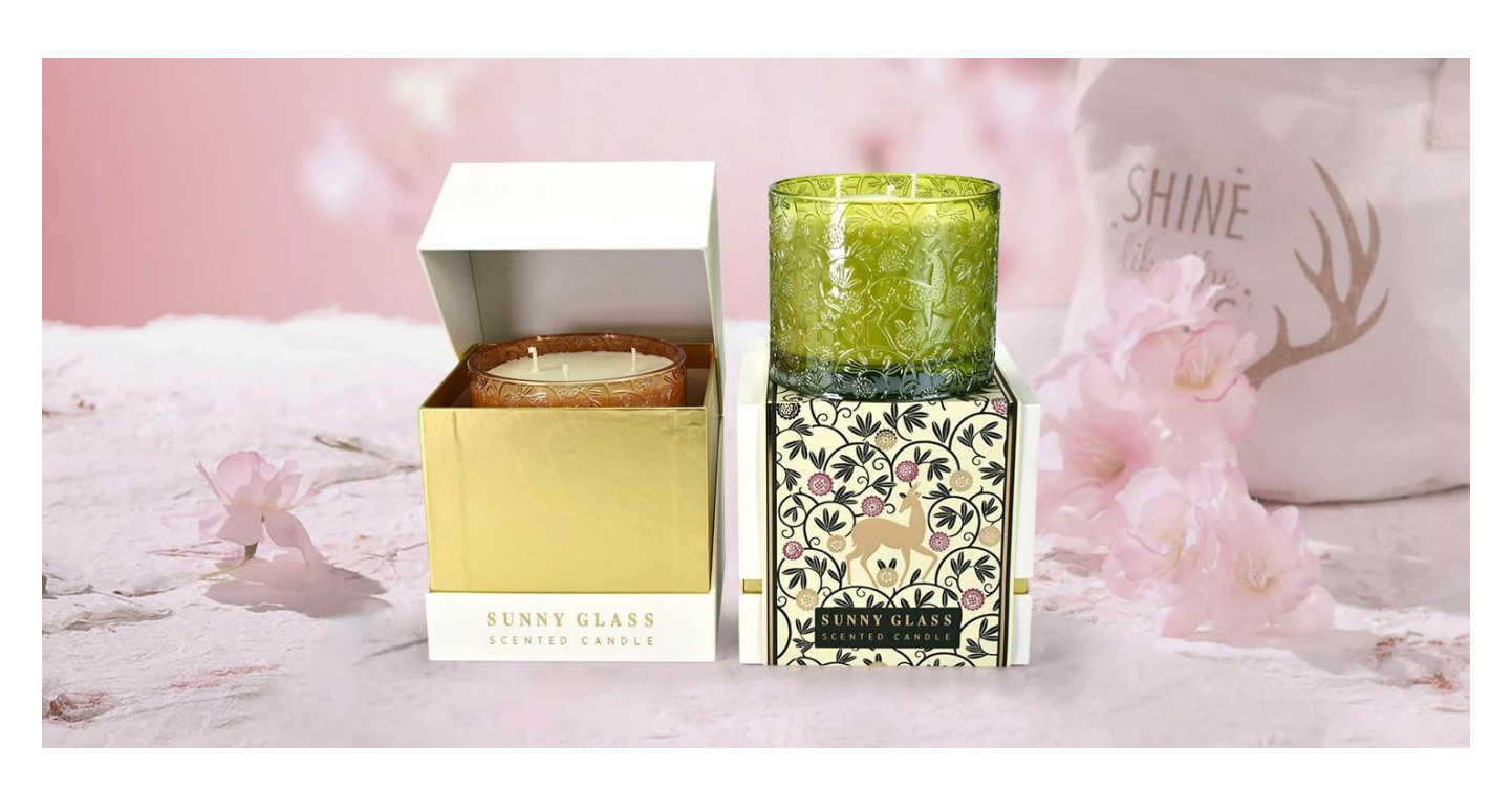
Your logo can be designed as an exclusive label on your branded candle holder packaging box