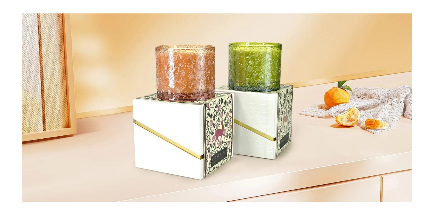
Your logo can be designed as an exclusive label on your branded candle holder packaging box