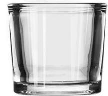
No. SGBZ6559HT 2oz/90ml/200g H59 T65 B59

Your logo can be designed with exclusive label on the candle jars for your brand