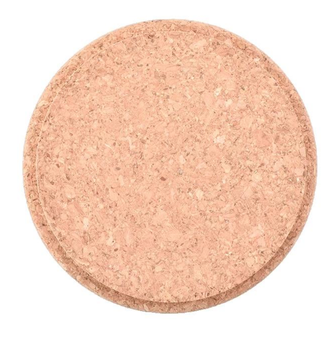
The pattern of this \underline{cork\ lids} can be customized according to your requirement