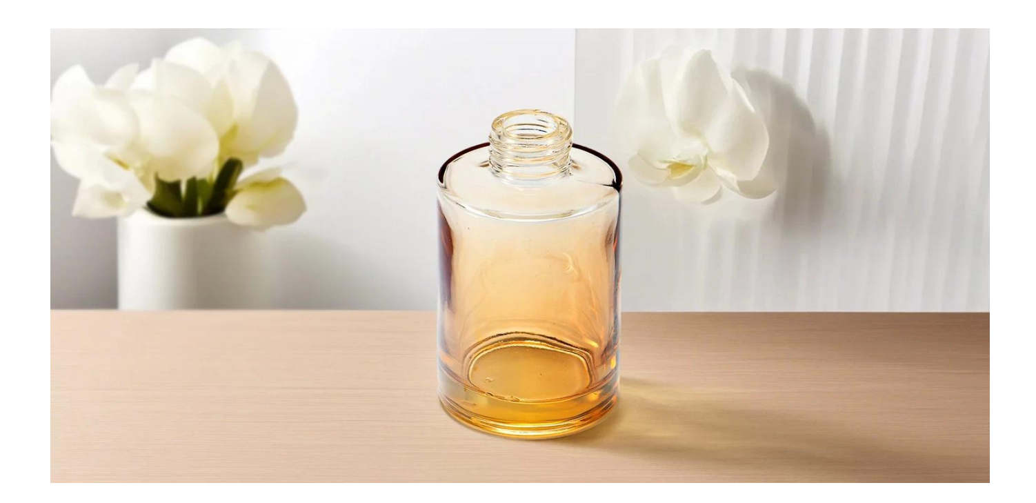
This 150ml <u>glass diffuser bottle</u> of gradient perfume - a bottle not only holds fragrance, but also works of art on the table. Every gradual change is the ultimate pursuit of beauty, so that every spray becomes a double feast of vision and smell.