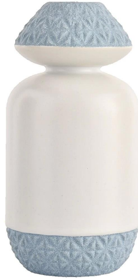
Blue bottle mouth and bottom engraved designs