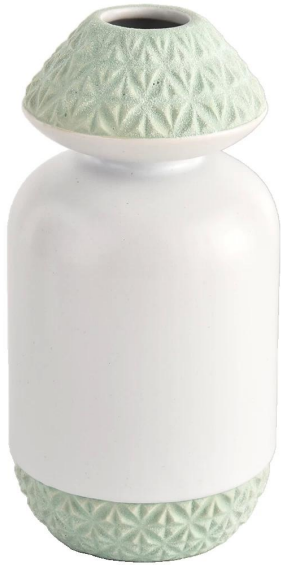
Green bottle mouth and bottom engraved designs