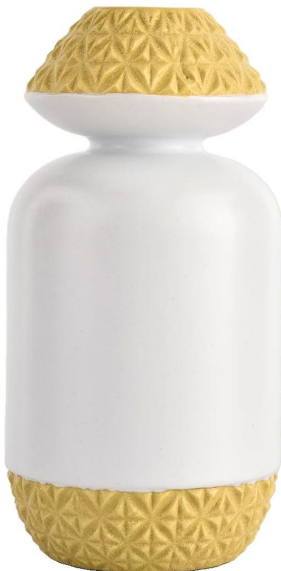
Yellow bottle mouth and bottom engraved designs