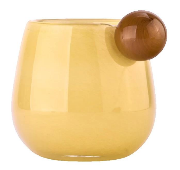
Green glass candle holder with ball handle