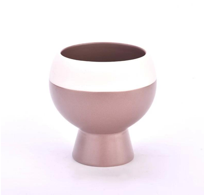
260ml ceramic candle jars