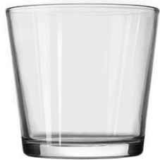
No. SGBZ135128V 30oz/ 1110ml/ 738g H128 T135 B106

These V-shaped clear glass candle jars come in a variety of sizes and we can customize them according to your requirements