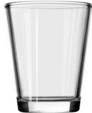
No. SGBZ101124V 14oz/ 513ml/ 475g H124 T101 B73