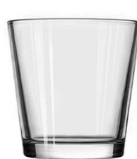
No. SGBZ100101V 12 oz/ 435ml/ 408g H101 T100 B76