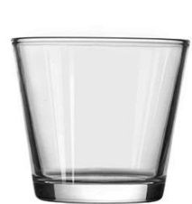
No. SGBZ9083V 8oz/ 288ml/ 251g H83 T90 B65

Your logo can be designed with exclusive label on the candle jars for your brand