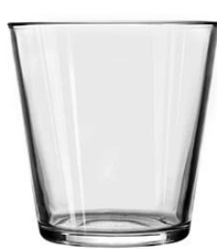
No. SGBZ108112V 16oz/ 600ml/ 371g H112 T108 B80