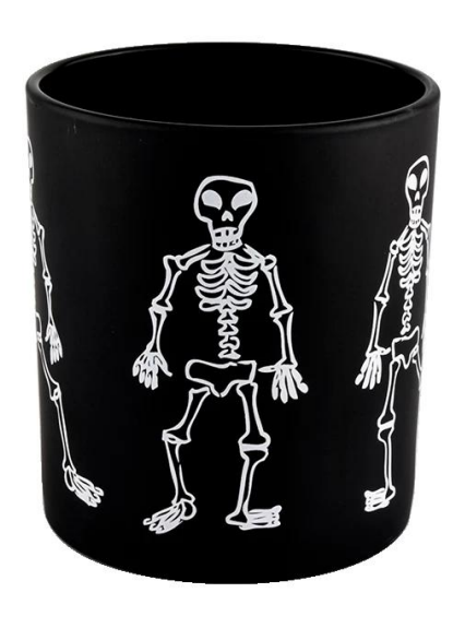
Black Halloween skeleton graffiti \underline{\textbf{glass candle jar}}