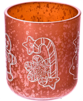
Brownness Christmas decal paper glass candle holder with lid