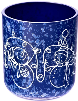
Dark blue Christmas decal paper glass candle holder with lid