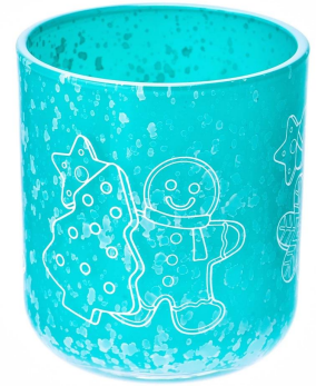
Sky blue Christmas decal paper glass candle holder with lid