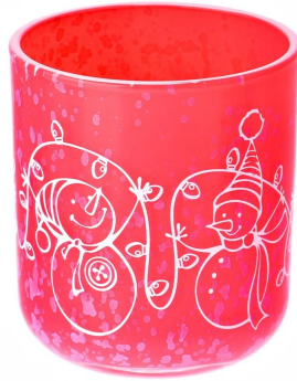
Rose red Christmas decal paper glass candle holder with lid