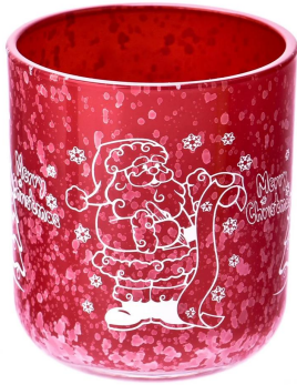
Red Christmas decal paper glass candle holder with lid