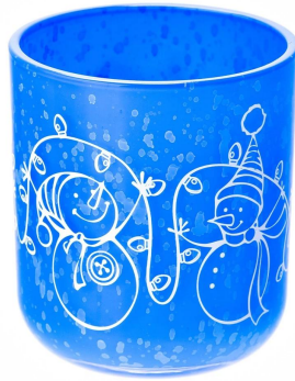
Baby blue Christmas decal paper glass candle holder with lid