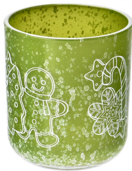
Grass green Christmas decal paper glass candle holder with lid