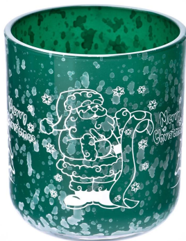
Dark green Christmas decal paper glass candle holder with lid