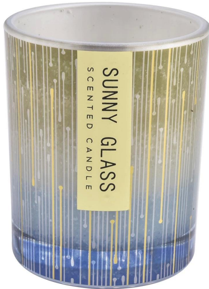
vertical stripe blue and yellow