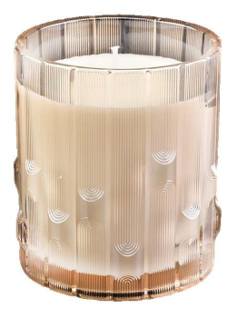
syllable jar white {\color{black} glass\ candle\ jars}