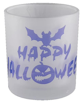
Purple Halloween graffiti glass candle jar

Blue Halloween graffiti glass candle jar