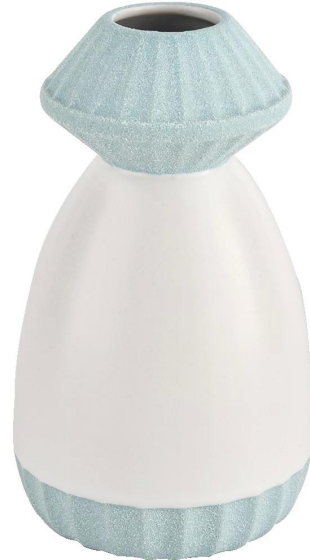
Blue bottle mouth and bottom