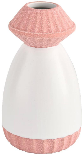
Pink bottle mouth and bottom