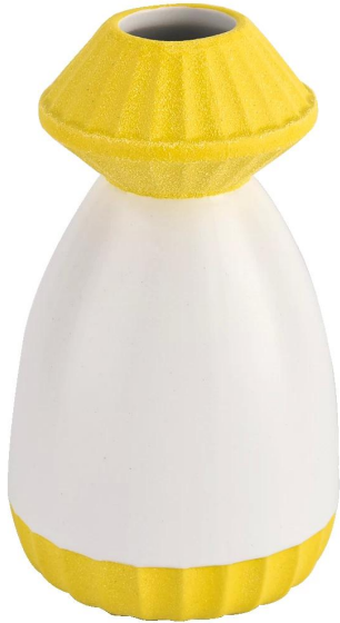
Yellow bottle mouth and bottom