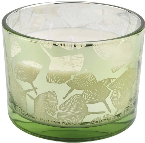
Purple deer pattern