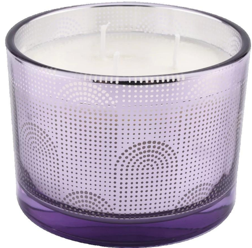
Purple flower pattern