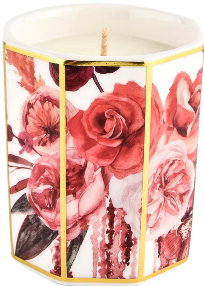
Octagonal decal of red roses