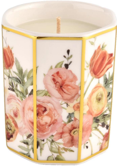
Pink orange rose decal octagon