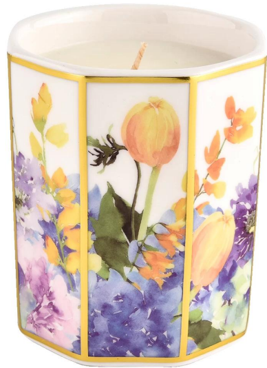
Octagonal decal of tulips