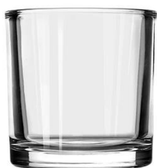
No. SGBZ100100HT 12oz/435ml/690g H100 T100 B93

texture and is easy to clean. glass candle jars addition to making scented candles, glass candle jars if some small items at home are difficult to put away, such as cotton swabs, makeup remover cotton, jewelry, etc., this glass candle holder can keep the home neat and clean.