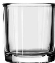
No. SGBZ7479HT 4.5oz/185ml/300g H79 T74 B69