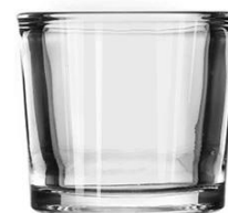
No. SGBZ6559HT 2oz/90ml/200g H59 T65 B59

Your logo can be designed with exclusive label on the glass candle jars for your brand