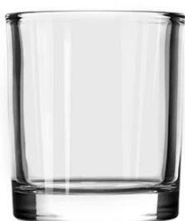
No. SGBZ8090HT 7oz/260ml/375g H90 T80 B75