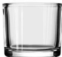
No. SGBZ9180HT 8oz/300ml/430g H80 T91 B86