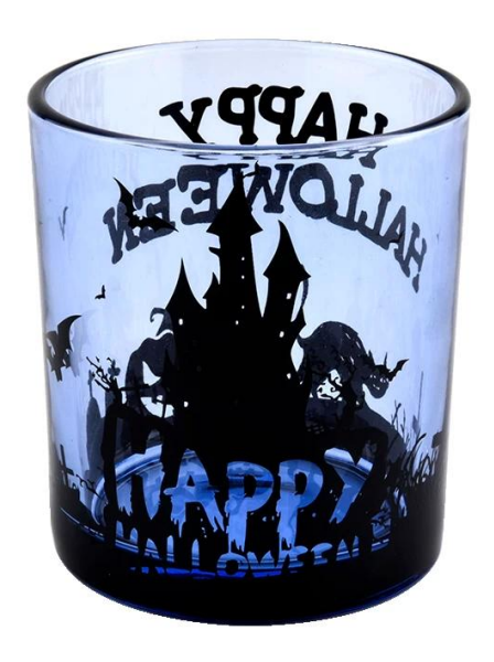
clear {f glass\ candle\ jars}