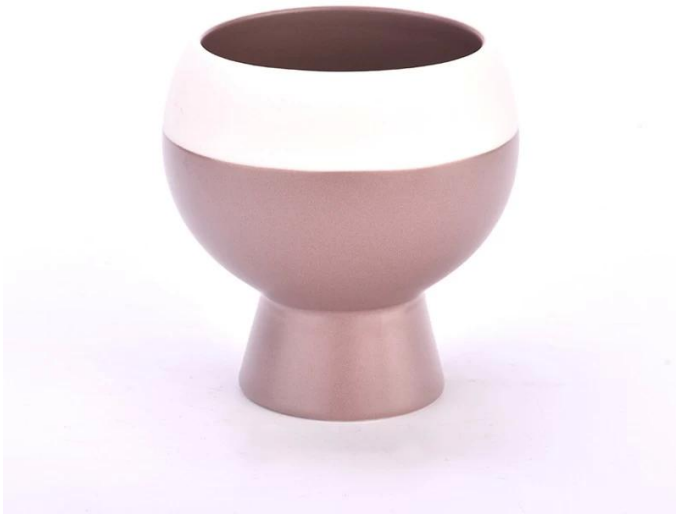
260ml ceramic candle jars