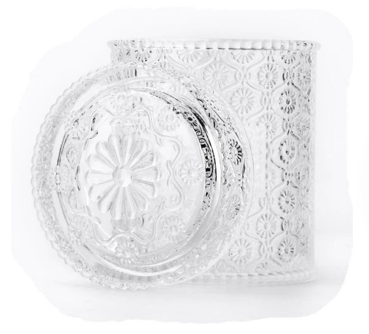
741ml with lid glass candle jars