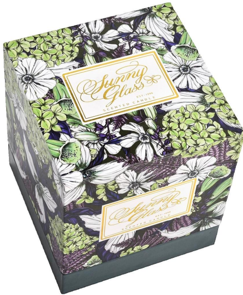
Dark green pattern