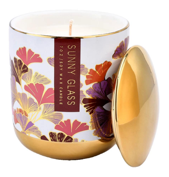
Green gingko leaf pattern ceramic candle holder with lid