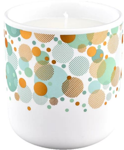
Multicolor spherical geometric pattern