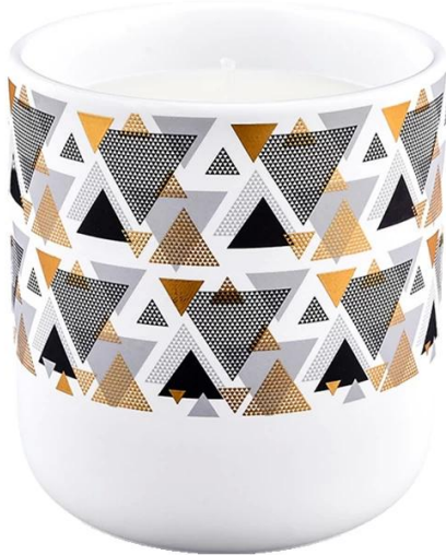
Multi-colored diamond geometric pattern