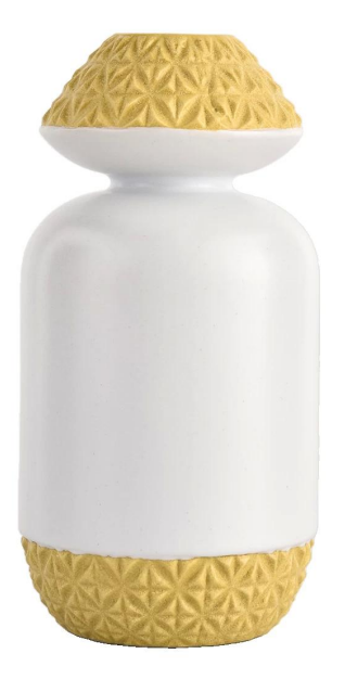
Yellow bottle mouth and bottom engraved designs