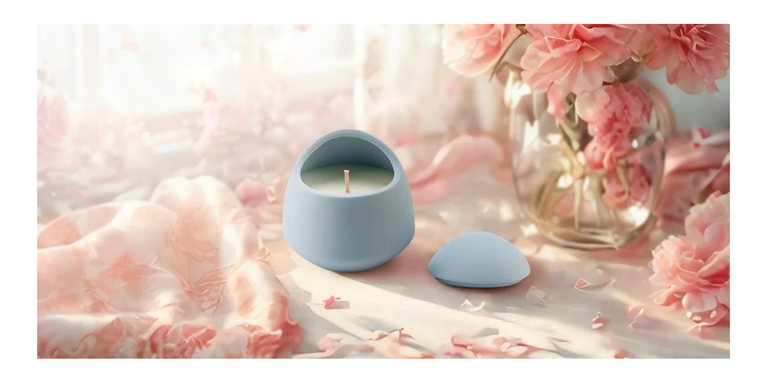
Mother's Day Limited Edition: Inspired by the first curve of a new life's birth, the egg-shaped can body is like jade gently caressed by time, symbolizing the tolerance and eternity of maternal love. The blue glaze surface flows with hand-kiln-transformed star river patterns, and under the light, it glows with a mother-of-pearl luster - just like the stars twinkling in her eyes when she was young, still elegant and radiant after the passage of time.