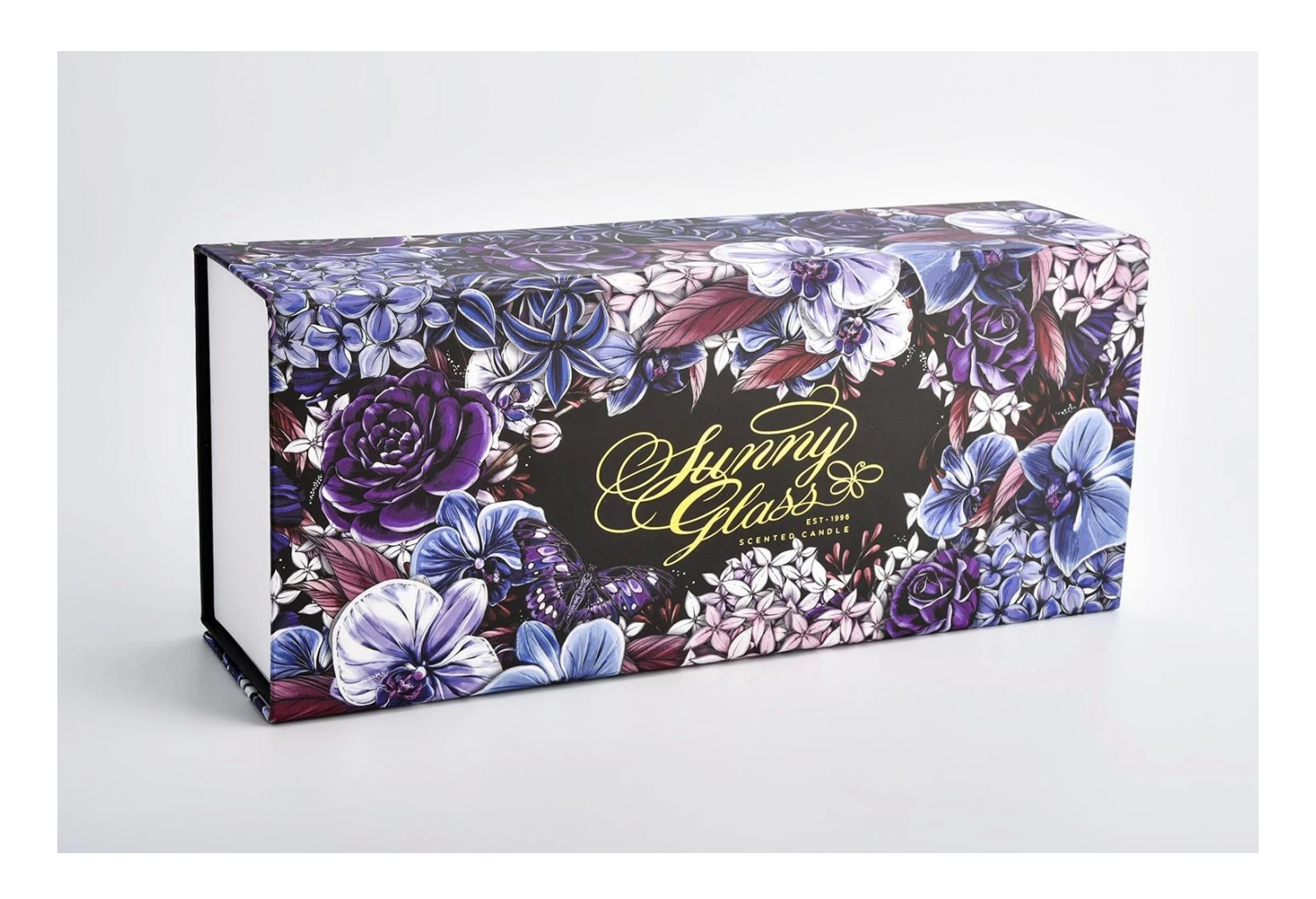
Your logo can be designed as an exclusive label on your branded gift box